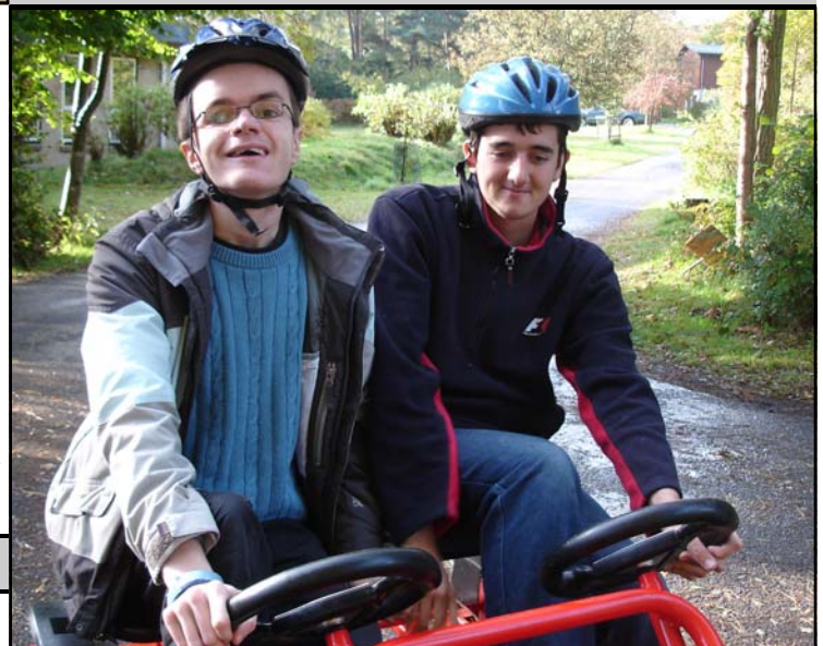
(right) Enjoying Go-Karts during an Activity Day!