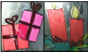
Photos: window transparencies from Sheiling House; chutney making; more transparencies; Panto